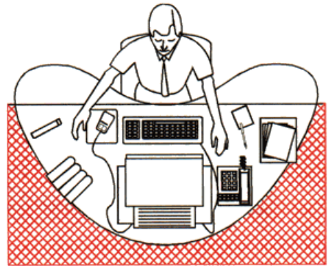
Figure 1: Alignment and Desk Set-up