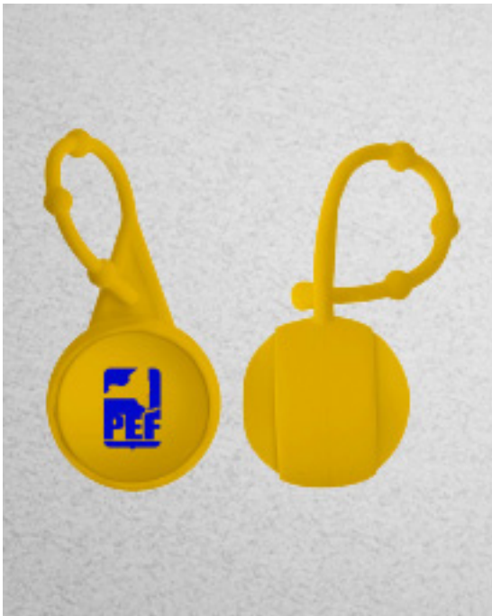
PEF Common Carabiner Colors: Yellow, White, Black, Blue