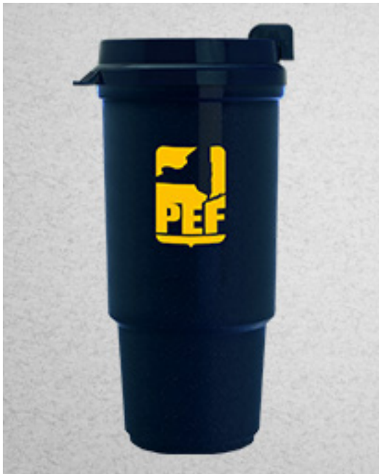
Metallic Navy Blue Shown